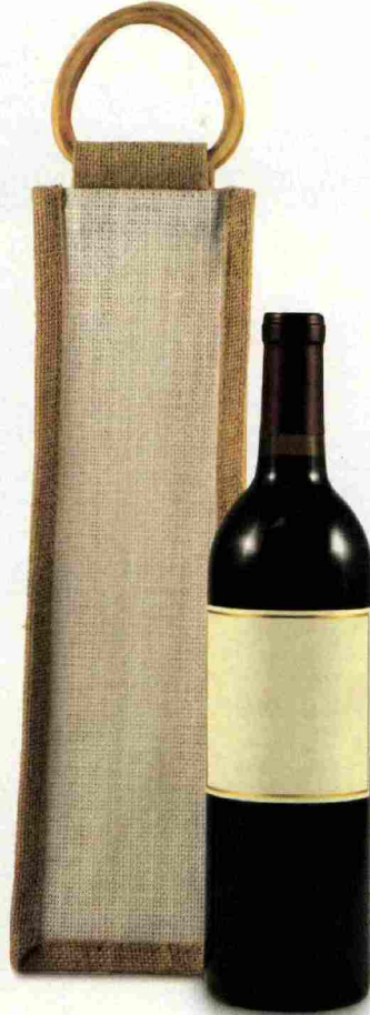
( Eco-jute single wine tote with custom bamboo handles )