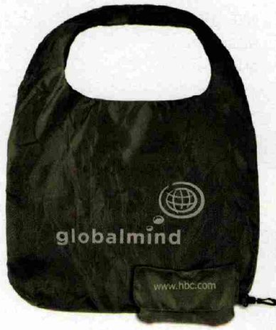
( 100% nylon small tote with easy-storage pouch )