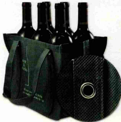
( 100% recycled non-woven polypropylene 6-bottle wine tote with grommet reinforcements )